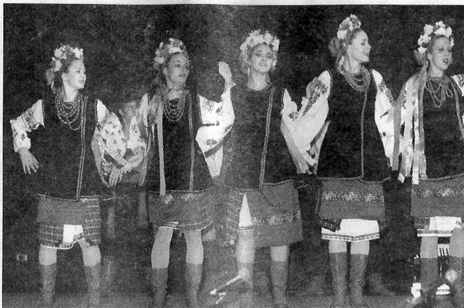
The ladies of the Syzokryli Dance Ensemble on stage.