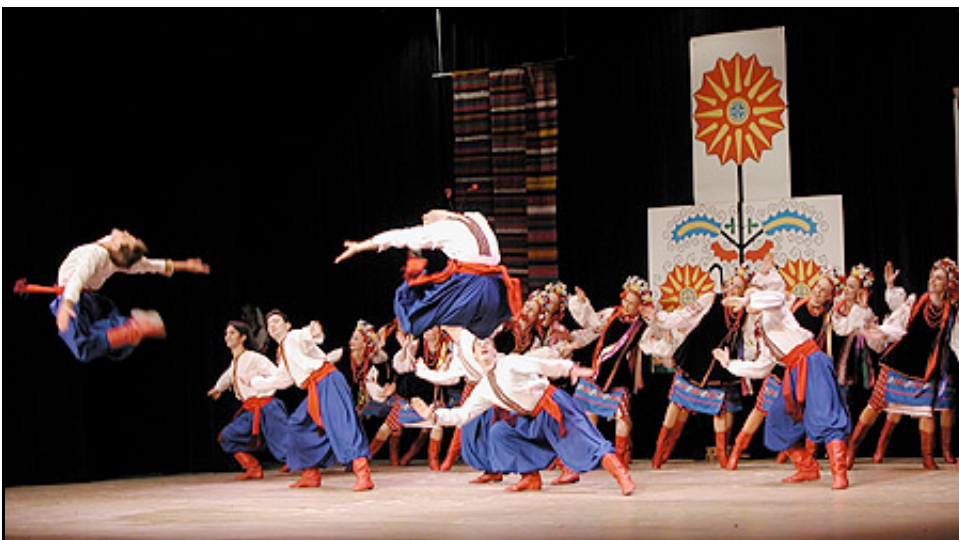
Syzokryli Ukrainian Dance Ensemble "Hopak"