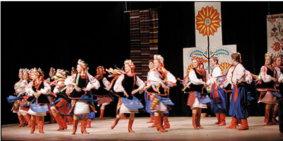
Syzokryli Ukrainian Dance Ensemble "Hopak"